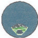
Lake Mission Viejo Lifeguard Association