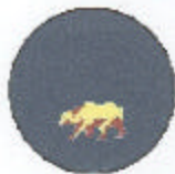
California State Lifeguard Association