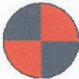
Solana Beach Lifeguard Association