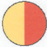
L.A. County Lakes Lifeguard Association