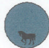
Del Mar Lifeguard Association.