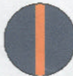
San Clemente Lifeguard Association