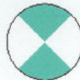
Laguna Beach Lifeguard Association