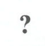
Central Coast, San Luis Obispo