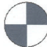
Honolulu Chapter, HI.