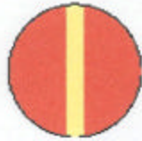
Long Beach Lifeguard Association, CA.