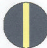
Oceanside Lifeguard Association