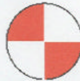
Huntington Beach Surf Life Saving Association