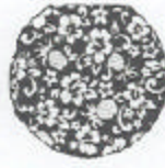
L.A. County Lifeguard Association