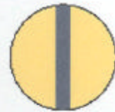
Newport Beach Lifeguard Association.