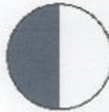
L.A. City Lifeguard Association