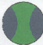
Santa Barbara Lifeguard Association