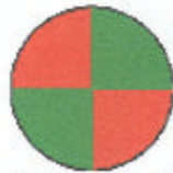
Ventura County Lifeguard Association