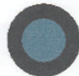
San Diego Lifeguard Association