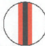
Santa Cruz Lifeguard Association