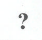
Coronado Beach Lifeguard Association