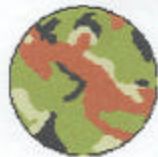
Camp Pendleton Lifeguards