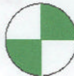
Seal Beach Lifeguard Association