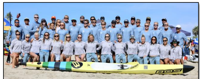
LA COUNTY NATIONALS TEAM