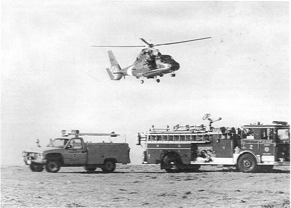
L.A. County Fire Department Lifeguard and Fire personnel conducting joint training with the Coast Guard.