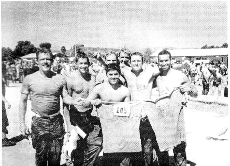
Participants showing off their mud after the race.

At first, running through the woods, the creeks and the sand pits was (Continued on p. 11)