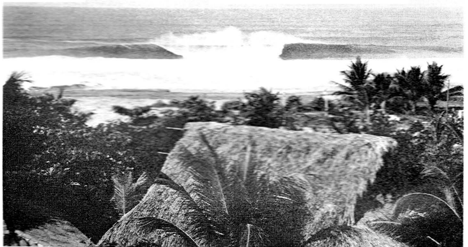
Puerto Escondido, October 1995.