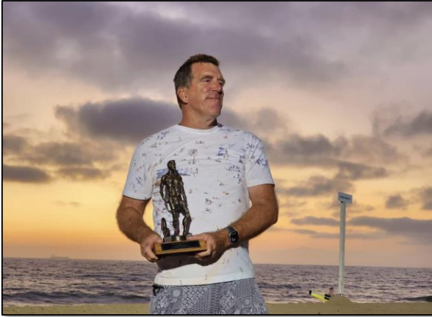
Bronze Savage Award at International Surf Festival