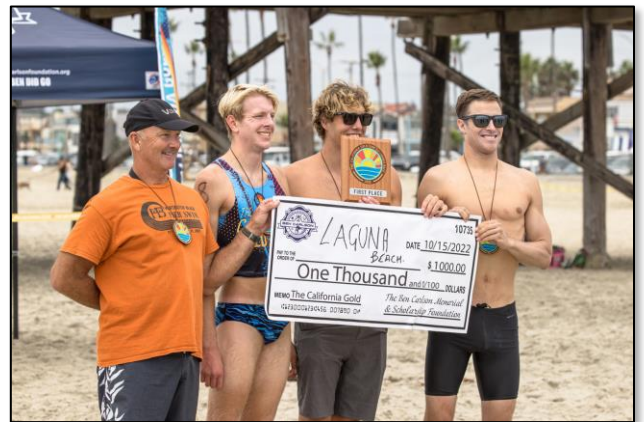
Laguna Beach Lifeguard Winners at the finish line

Each Lifeguard Agency Team or Individual that participates will get 1 raffle ticket and each Junior Lifeguard Team that participates will get 2 raffle tickets. At the after party a drawing will be held in which the lifeguard agency drawn will win the grant money raised from the entry fee profits.