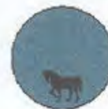
Del Mar Lifeguard Association.