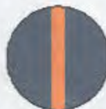
San Clemente Lifeguard Association