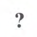
US Ocean Safety Lifeguards, CA.