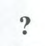
Hawaiian Lifeguard Association