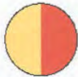
L.A. County Lakes Lifeguard Association