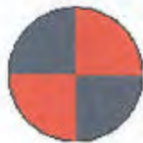
Solana Beach Lifeguard Association