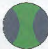
Santa Barbara Lifeguard Association