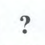
Imperial Beach Lifeguard Association