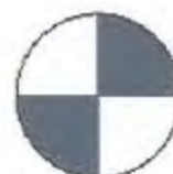
Honolulu Chapter, HI.