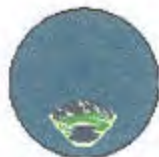
Lake Mission Viejo Lifeguard Association