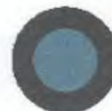
San Diego Lifeguard Association