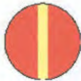
Long Beach Lifeguard Association, CA.