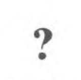
Capitola Beach Lifeguard Association