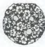
L.A. County Lifeguard Association