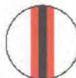
Santa Cruz Lifeguard Association