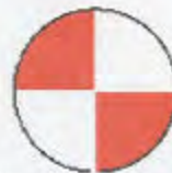
Huntington Beach Surf Life Saving Association