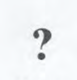
Encinitas Lifeguard Association