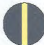
Oceanside Lifeguard Association