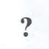
Port Hueneme Lifeguard Association, CA.