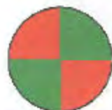
Ventura County Lifeguard Association