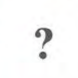
Central Coast, San Luis Obispo