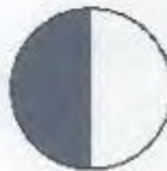
L.A. City Lifeguard Association