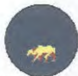
California State Lifeguard Association