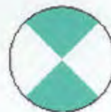
Laguna Beach Lifeguard Association