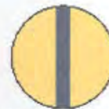
Newport Beach Lifeguard Association.