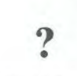
Coronado Beach Lifeguard Association