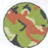
Camp Pendleton Lifeguards