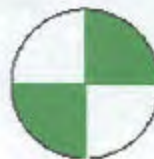
Seal Beach Lifeguard Association