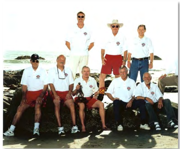
“The Chiefs” LA County - photo taken in 2012