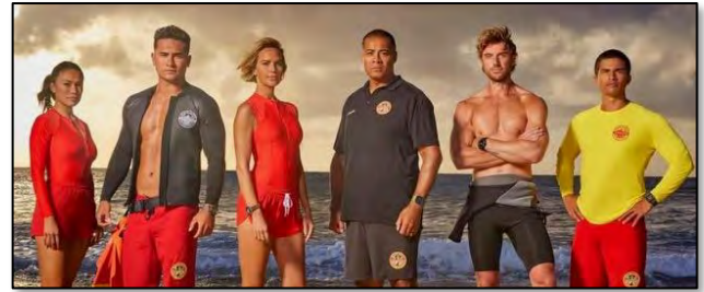
Cast of “Rescue: HI-Surf”