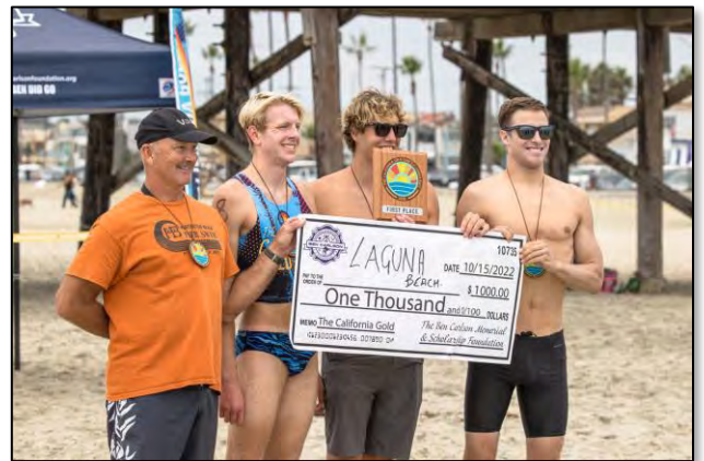
Laguna Beach Lifeguard Winners at the finish line

Each Lifeguard Agency Team or Individual that participates will get 1 raffle ticket and each Junior Lifeguard Team that participates will get 2 raffle tickets. At the after party a drawing will be held in which the lifeguard agency drawn will win the grant money raised from the entry fee profits.