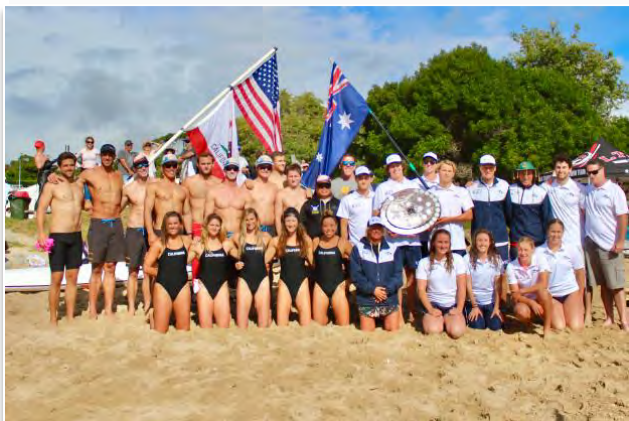
California and Australian lifeguards come together for a photo on the sand during a recent exchange program.