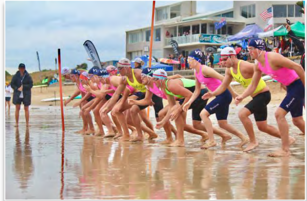
Competition is fierce between Australian and California guards, who have long had a rivalry in and out of the water.

He said one of the big differences there is that lifeguards put up flags early in the morning, marking the safe areas where swimmers are allowed. Here, the practice is to staff lifeguards in towers, and patrol and respond when there’s danger.