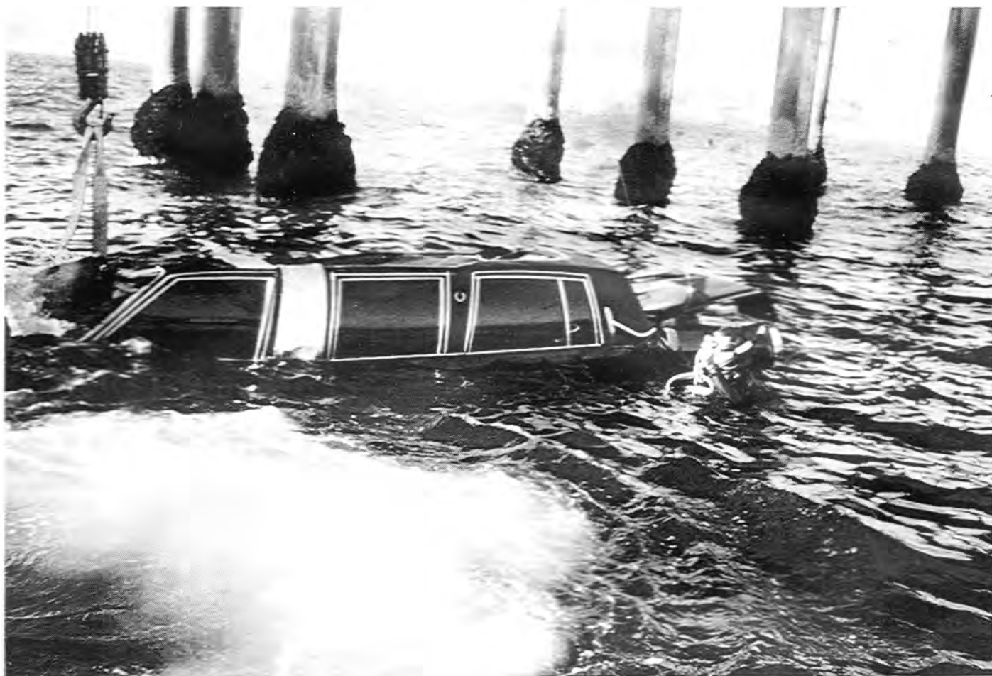
Huntington Beach Lifeguard's Dive Team was used to recover a Limousine that was deliberately pushed off the pier. A crane hoisted the car back on the pier.